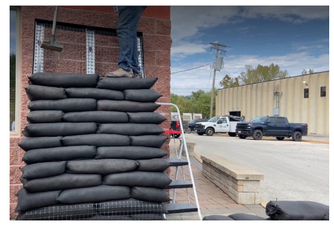
Flex MSE Demo Wall at ASP's St. Louis Office