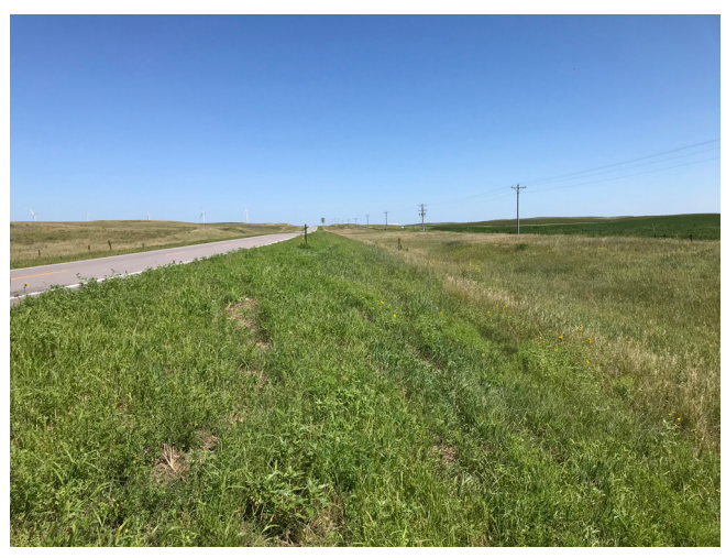
Results 10 Months After Installation of ProGanics and Erosion Control Solutions