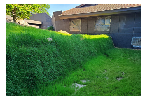
Flex MSE Wall at Henry Doorly Zoo's Gorilla Exhibit - Supplied by ASP Enterprises