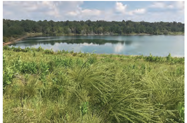
1 Year After Application