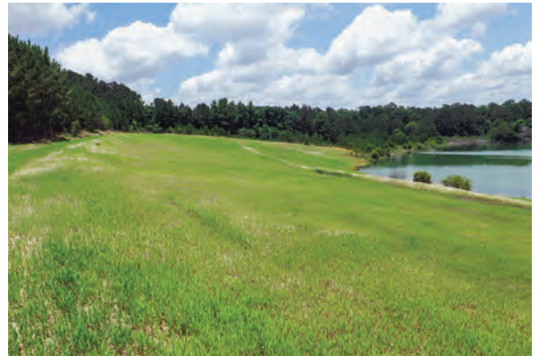
4 Months After Application