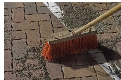
Permeable Paver Cleaning