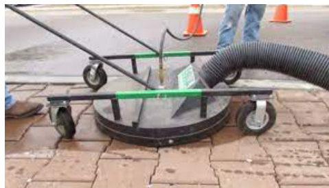
PaveDrain Vac Head for Cleaning