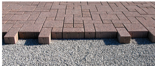
Unilock Permeable Pavers