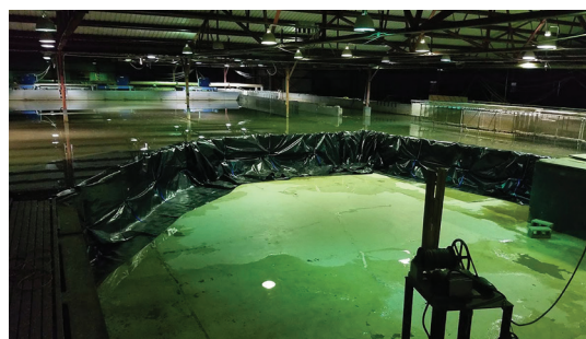
Images of testing conducted on Muscle Wall at the US Army Engineer Research and Development Center.