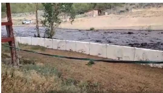
Muscle Wall used as perimeter protection to protect a homeowner's house and property from flash flooding.