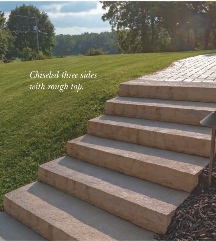
Chiseled three sides with rough top.