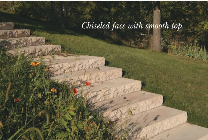
Chiseled face with smooth top.