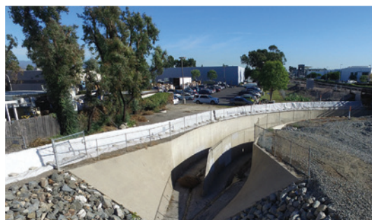
Orange County, CA