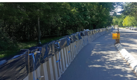
Boise City, ID