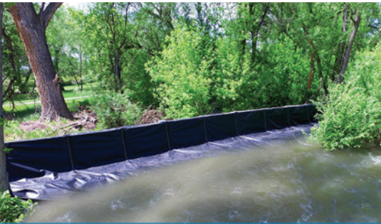
Logan City, UT