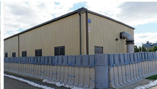
Bayshore Sewerage, NJ