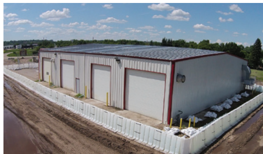
Medicine Hat, AB, CA