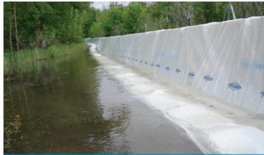
Ada County, ID