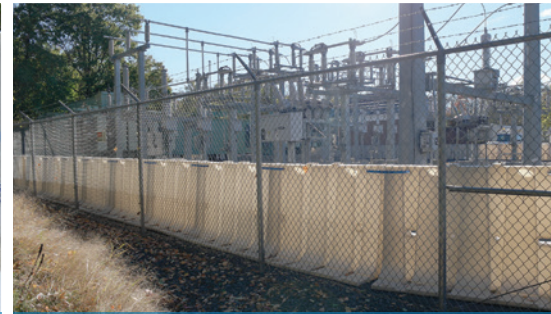
Rockland Power, NJ