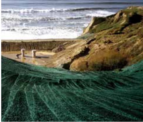
Less expensive than extended term blankets, and less soil preparation is required