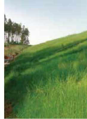
Effective immediately and grass grows twice as fast as blankets