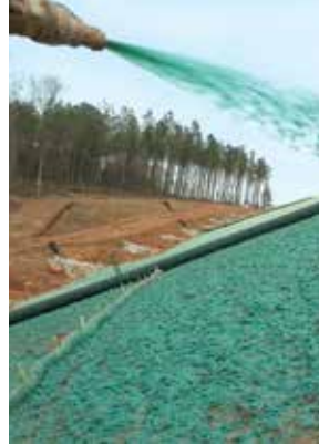
Twice the longevity with the same effectiveness and cost-savings as other hydraulic applications