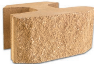
Beveled Split Size: 8" H x 18" W x 12" D Weight: 80 lbs.