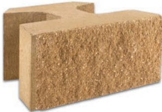
Straight Split Size: 8" H x 18" W x 12" D Weight: 80 lbs.

Unit specifications, availability, color, and fascia options vary by manufacturer. Please contact your nearest Rockwood manufacturer or dealer for more information.