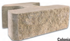
Colonial 18 Size: 6" H x 18" W x 12" D Weight: 60 lbs.