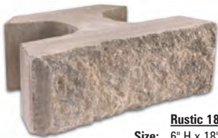
Rustic 18 Size: 6" H x 18" W x 12" D Weight: 60 lbs.

Unit specifications, availability, color, and fascia options vary by manufacturer. Please contact your nearest Rockwood manufacturer or dealer for more information.