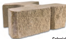
Colonial 6/12 Size: 6" H x 18" W x 12" D Weight: 60 lbs.