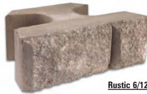
Rustic 6/12 Size: 6" H x 18" W x 12" D Weight: 60 lbs.