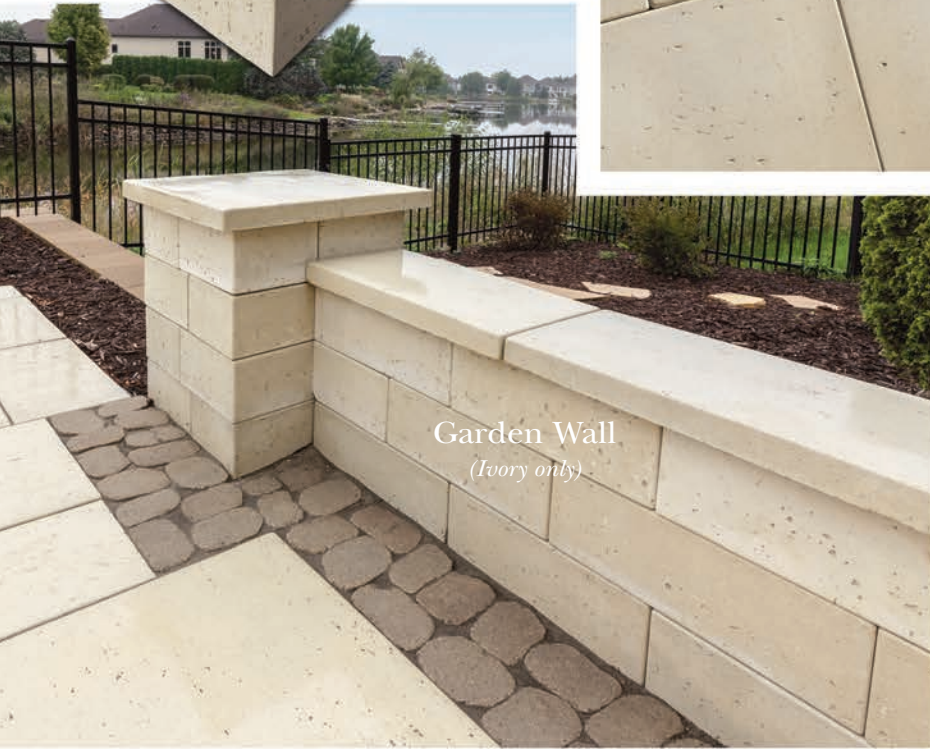
Garden Wall (Ivory only)